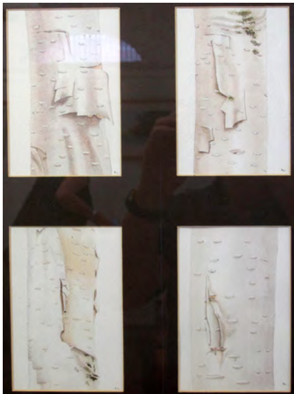
9 Alan Learney Silver Birch Watercolour £115