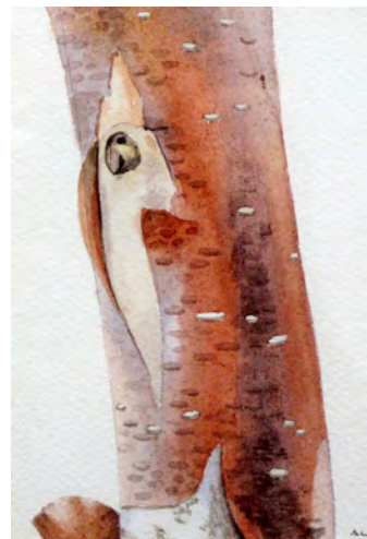
6 Alan Learney Copper Birch 2 Watercolour £35