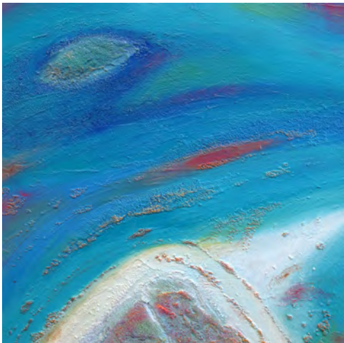
21 Julie Sailing-Free Samson Island, Isles of Scilly Acrylic on canvas £80