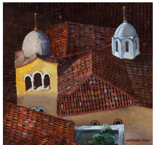
25 Nicholas Rous Evening rooftops, Athens Gouache £98