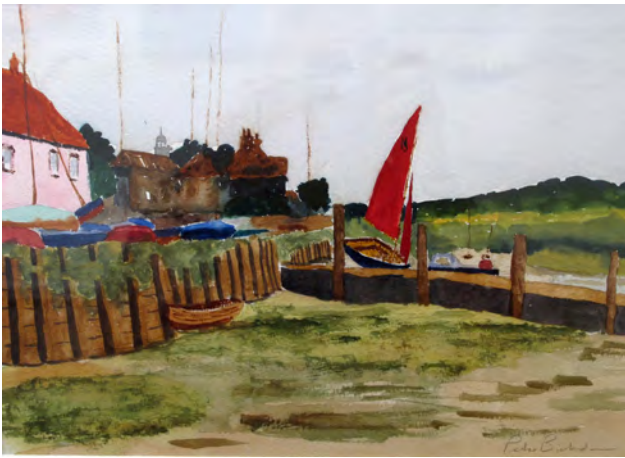
2 Peter Bickerton Burnham Overy Staithe Watercolour £75