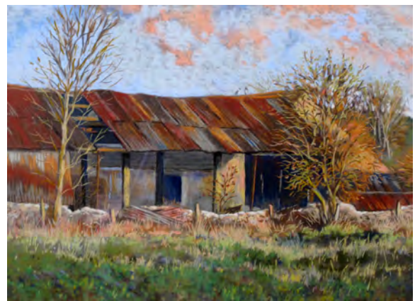
13 Eric White Abbey Farm Barns 2004 Pastel £140