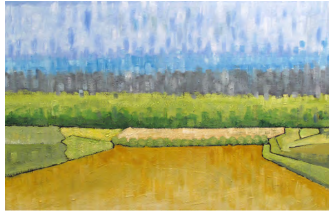
12 Paul Hughes Bridewell #II Oil on board £120