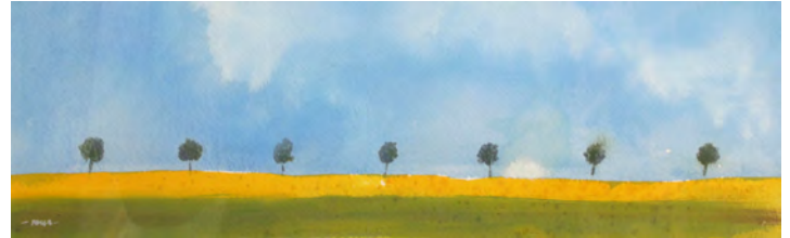
4 Nicholas Rous Somewhere in northern France Gouache £60