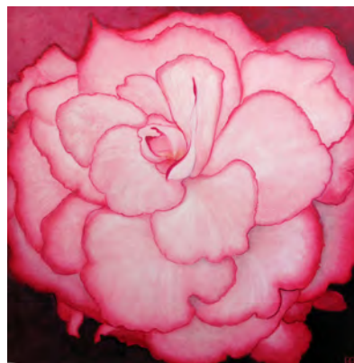
19 Diana Homer Begonia Mixed media £150