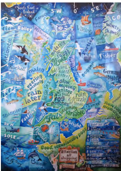
22 Jane Tomlinson Attention All Shipping Print of original watercolour £100