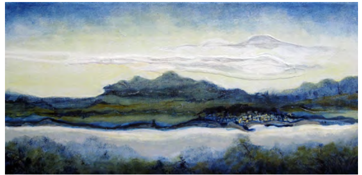
5 Diana Homer Clouds over the island Mixed media £90