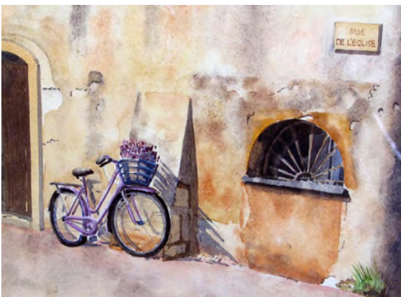
10 Alan Learney Lavender delivery Watercolour £90