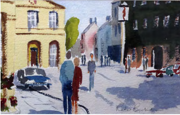
1 Peter Bickerton Woodstock Watercolour £55