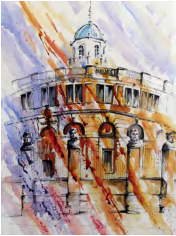
15 Jenny Bowden Sheldonian, Oxford Watercolour £135