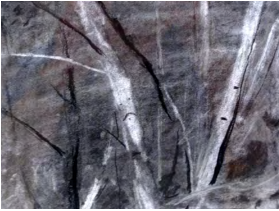
8 Christine Dowling Shotover Woods Charcoal and white chalk £60