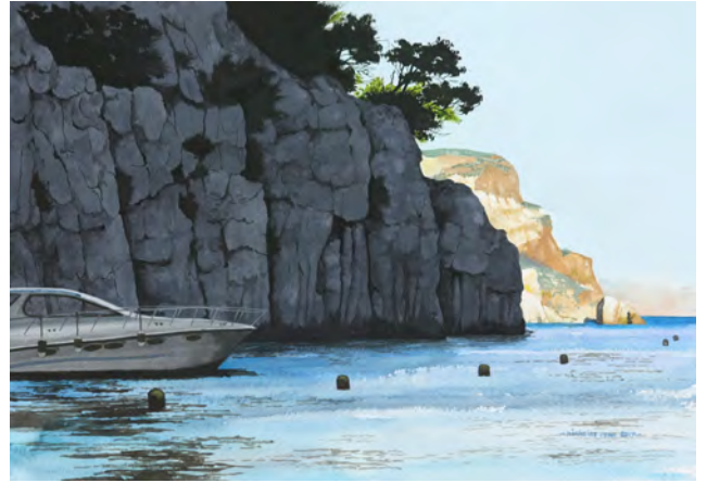
23 Nicholas Rous Sunlight and shadow, Cote Vermeille Gouache £140