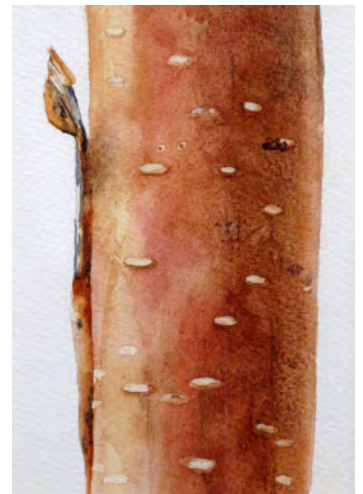
7 Alan Learney Copper Birch 1 Watercolour £35 (£60 for the pair)