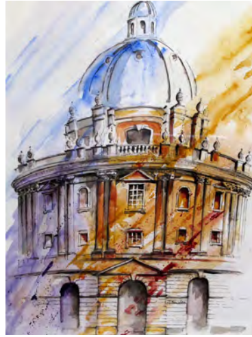
17 Jenny Bowden Radcliffe Camera, Oxford Watercolour £135