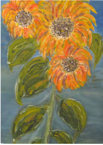
14 S.C.West Sunflowers Original oil painting £89.50