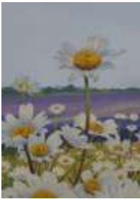
26. Julie Sailing-Free 'Oxeye Daisy, Leucanthemum vulgare ' Acrylic on wood 8" x 6" £55.00