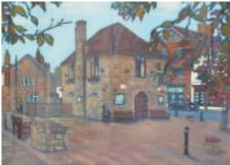
22. Julie Sailing-Free 'Market Square in Autumn, Eynsham' Acrylic on Board 11" x 16" £80