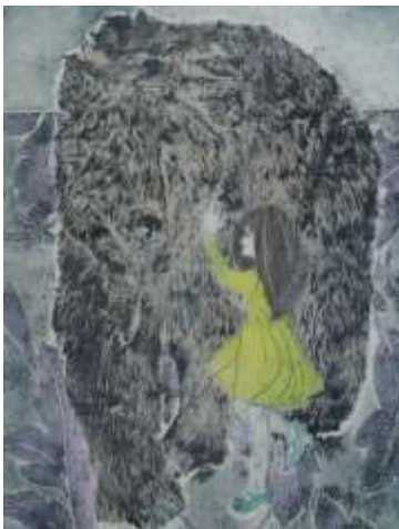
24. Alice Walker 'Tessa and the Bear' Collagraph 12" x 10" £240.00