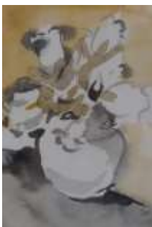
34. Christine Dowling 'Vase of flowers – ochre and black' Watercolour 7" x 5" £75.00