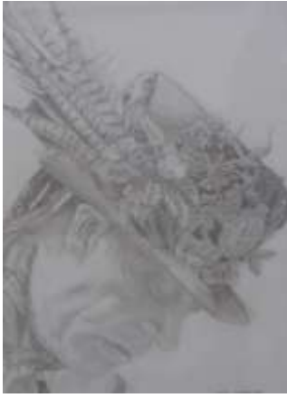
25. Lorna Marrison 'Morris Dancer' Graphite, coffee on Bristol board 12" x 8" £160.00 framed £100.00 unframed