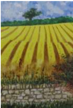
44. Robin Mitchell 'After Harvest - near Stonesfield' Watercolour 11" x 8" £75.00