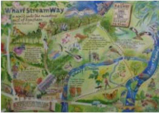
Jane Tomlinson 'Wharf Stream Way' Watercolour 19" x 27" £750.00

"This painted map of the route of a new permissive footpath through the meadows to the east of Eynsham was commissioned by West Oxfordshire District Council for an interpretation panel at the start of the route. It shows some of the features, history and nature to be spotted on the walk. Prints of the painting can be ordered here: http://pr-nt.me/oxfordmap ."