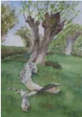
45. Robin Mitchell 'On the way to Wilcote Grange' Watercolour 11" x 8" £75.00