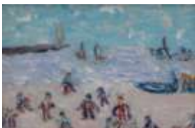
46. S. C. West 'At the Seaside' Painting in Oils 4" x 6" £22.00