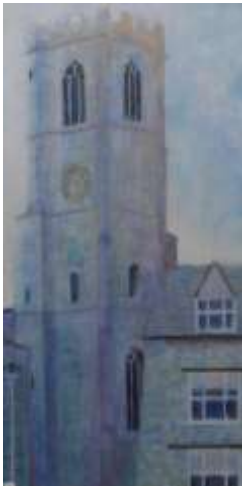
Diana Homer 'Early Morning' Acrylic & Oil 20" x 12" £120.00