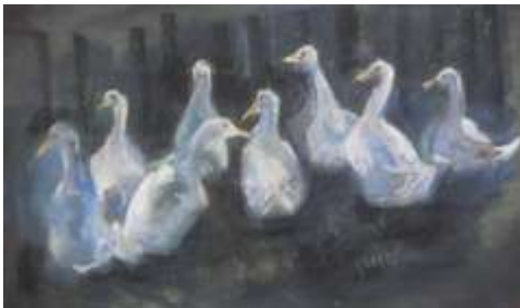
33. Jill Gemmell 'Aylesbury Duck' Pastel 9" x 14" £90.00