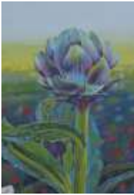
27. Julie Sailing-Free 'Globe Artichoke, Cynara carunculosa ' Acrylic on wood 8" x 6" £55.00