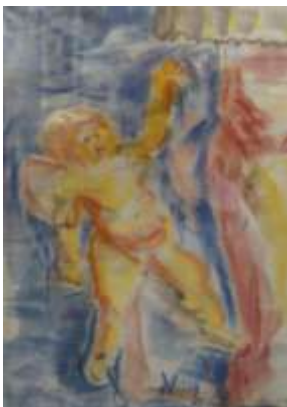
Nick Lewis 'Cherub close to Augustus Caesar – Ashmolean Museum, Oxford' Ink on Textured Paper 12" x 8" £75.00