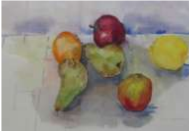
30. Jill Gemmell 'Fresh Fruit' Watercolour 9" x 13" £100