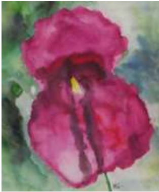
21. Nick Lewis 'Flower seen at Yarnton' Ink on Textured Paper 10" x 9" £75.00