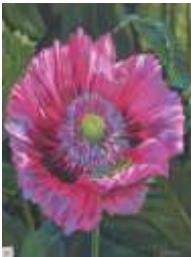
28. Julie Sailing-Free 'Opium Poppy, Papaver somniferous ' Acrylic on wood 8" x 8" £65.00