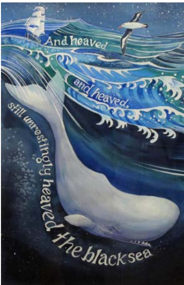
14 Jane Tomlinson Heaved the black sea Watercolour £175