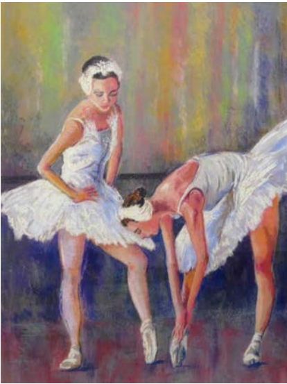
26 Eric White Next on stage Pastel £140