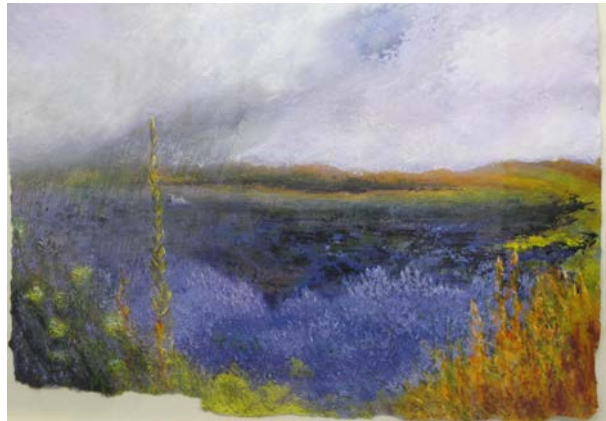
23 Diana Homer Shower over lavender fields Acrylic and oil £350