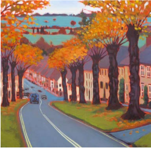
25 Julie Sailing-Free The Hill, Burford Acrylic on canvas £48