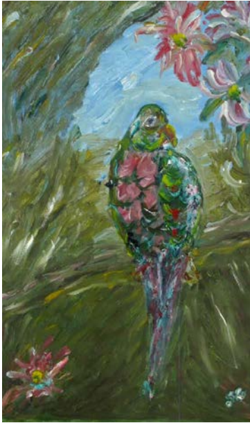
31 S. C. West Friend (Parrot) Oil £31.50