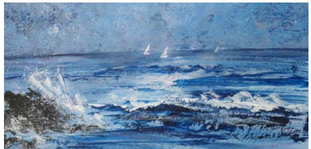
30 Delia Taylor-Brook Watching sailboats Mixed media £140