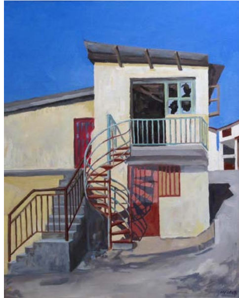
34 Paul Hughes One-roomed house with workshop below in Kyperounta, Cyprus Oil on canvas £200

'Traditional mountain village houses are often small and set on very steep hills with store rooms or workshops below.'