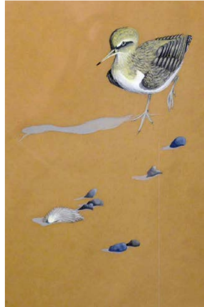
28 Nicholas Rous Sandpiper and shell Gouache £100