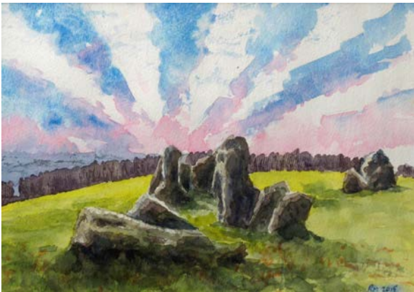
2 Robin Mitchell Rollright Stones: Evening sky Watercolour £80