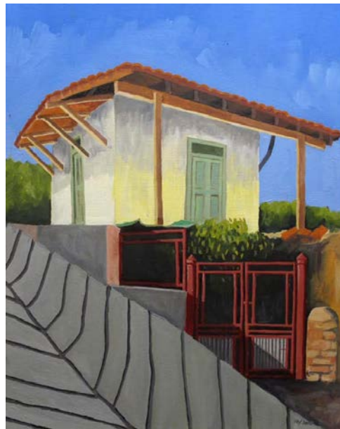
35 Paul Hughes One-roomed house with two doors in Kalia, Cyprus Oil on canvas £200

'Traditional mountain village houses are often small and set on very steep hills with store rooms or workshops below.'