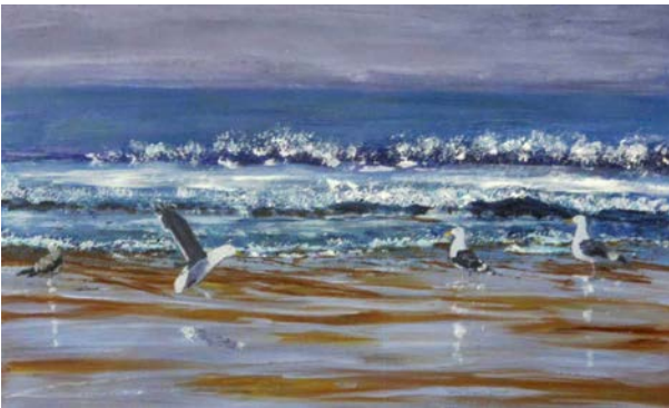
20 Delia Taylor-Brook Seagulls surfing Acrylic £200 'A Moment in Time' inspired me with my connection to the sea and its ever-changing character, colour and beauty'.