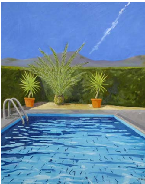
33 Paul Hughes Panorama swimming pool Oil on canvas £200