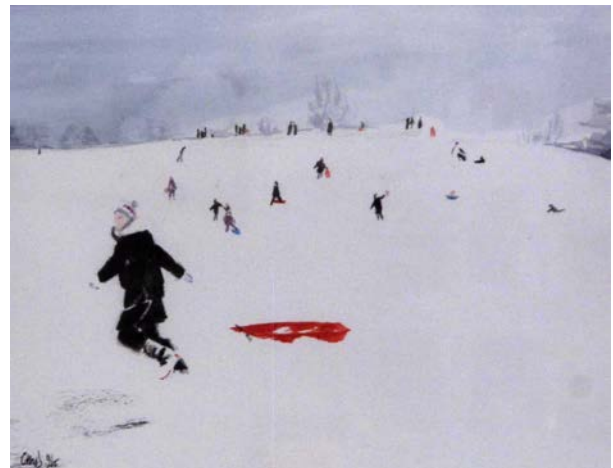
12 Christine Dowling Red sledges on hill Watercolour £80