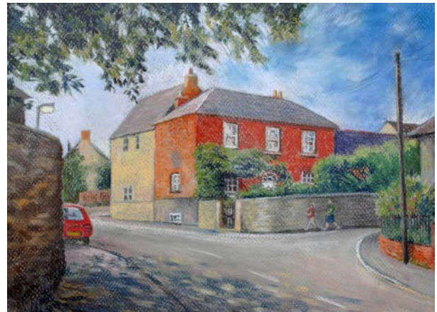
5 Eric White Hilltop, Eynsham Pastel £120