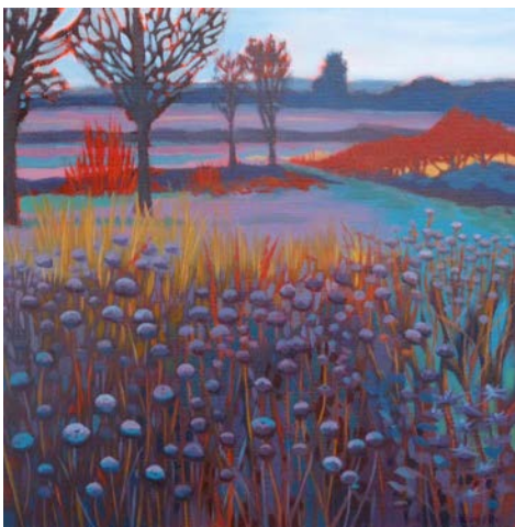
21 Julie Sailing-Free Sunset seedheads Acrylic on canvas £48