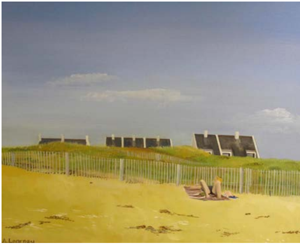
32 Alan Learney The reader Acrylic on canvas panel £90

'Traditional mountain village houses are often small and set on very steep hills with store rooms or workshops below.'