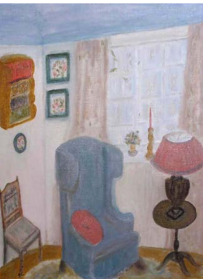
9 S. C. West The blue chair Oil £65