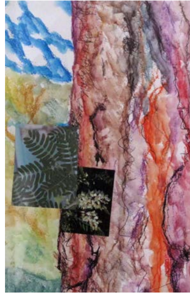
4 Nick Lewis Cobbet's Acadia' The Gables, Eynsham 2015 Acrylic and montage SOLD