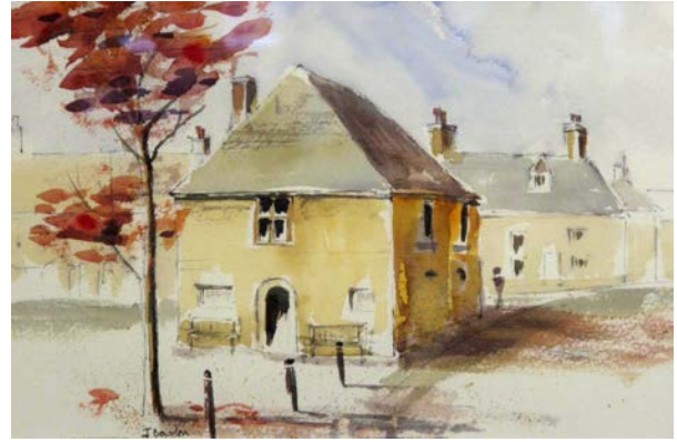
10 Jenny Bowden Autumn morning, Eynsham Watercolour £95