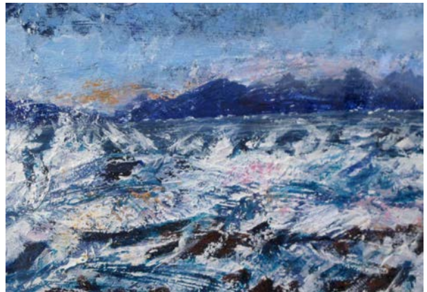
29 Delia Taylor-Brook Rough seas, Mull Acrylic £140