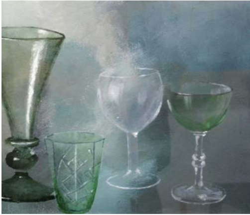
19 Penny Noel Four glasses Acrylics £150