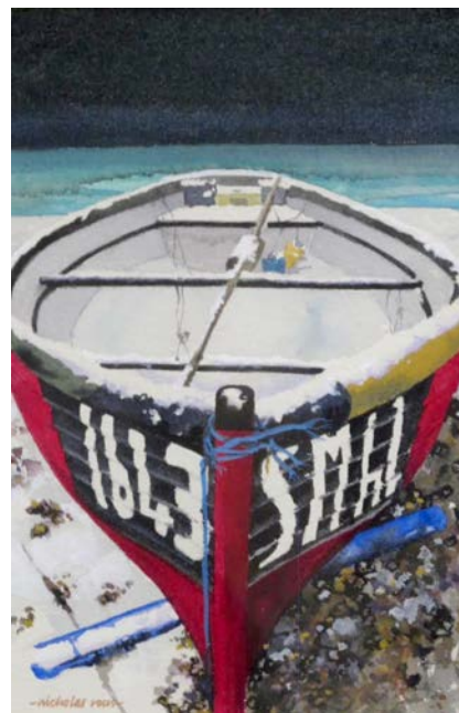
18 Nicholas Rous Boat on snow-covered beach, Sussex Gouache £110