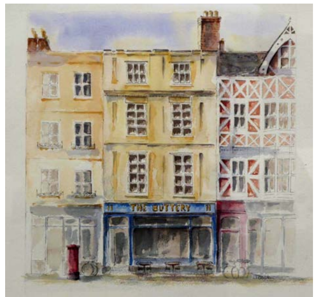
11 Jenny Bowden The Buttery, Broad Street, Oxford Watercolour NFS