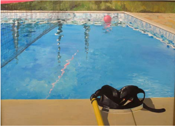
1 Alan Learney The Pool Acrylic on hardboard NFS