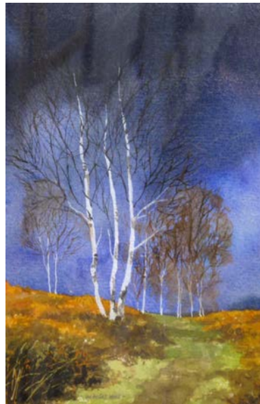
17 Nicholas Rous Approaching storm, Shotover Gouache £80