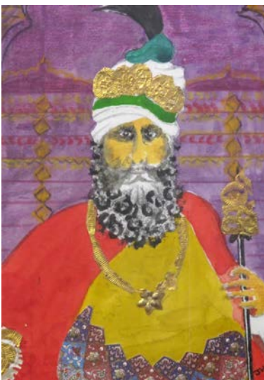
27 Jennifer Harland Maharajah Watercolour, crayon and collage £50