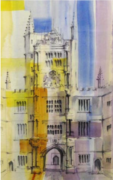
13 Jenny Bowden Bodleian Library, Tower of the Five Orders, Oxford Watercolour and ink £95