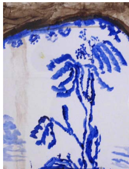
6 Nick Lewis Willow Pattern Acrylic and red ink line £70