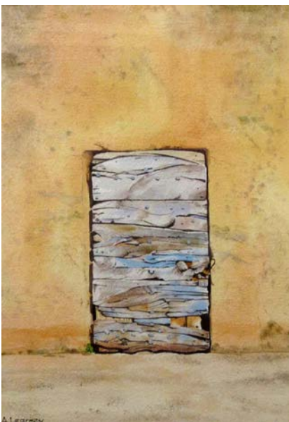
3 Alan Learney Roussilon Des Ocres Watercolour £65