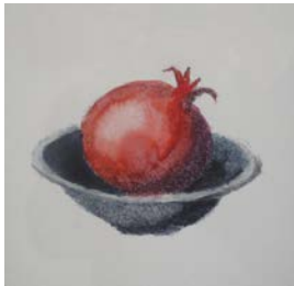
19 Penny Noel 'Pomegranate in Blue Bowl' Biro and Watercolour £75