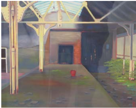
17 J Sailing-Free 'In Case of Fire' – The Fairford Branch Line, Witney Goods Shed' (Vintage Mahogany wood frame) Oil on Board £80