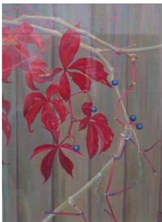
23 J Sailing-Free 'Crimson Creeper' Parthenocissus Quinquefolia (Oak Wood Frame) Oil on Board £80