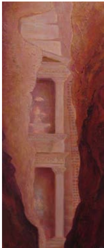
18 Diana Homer 'The Treasury, Petra' Acrylic £200