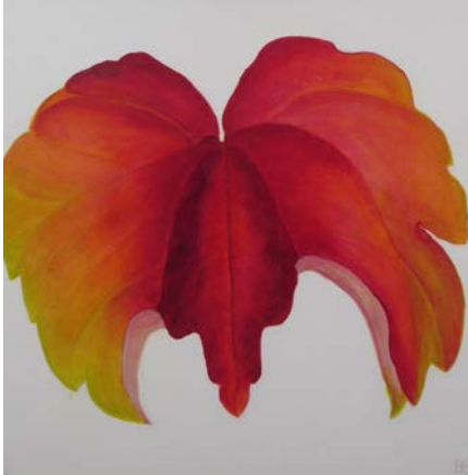
Diana Homer 'Boston Ivy - Autumn 1' Acrylic £180