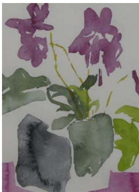
20 Christine Dowling 'Violet Primula' £90