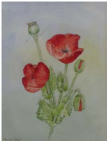
Deirdre Wright 'Field Poppies' Watercolour (10"x14") £45