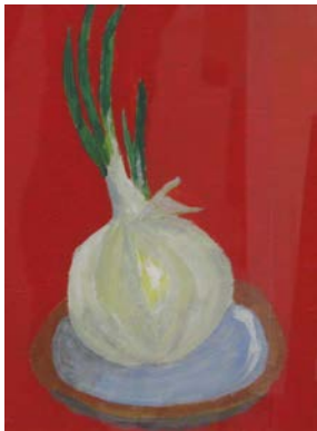
22 Penny Noel 'Onion on Blue Plate' Acrylics £75

A song thrush searches for a red berry in an autumnal tree. The bird motif is inspired by William Morris's 'the strawberry thief'. This painting is a collagraph (a printmaking technique) with collage, heightened with watercolour.